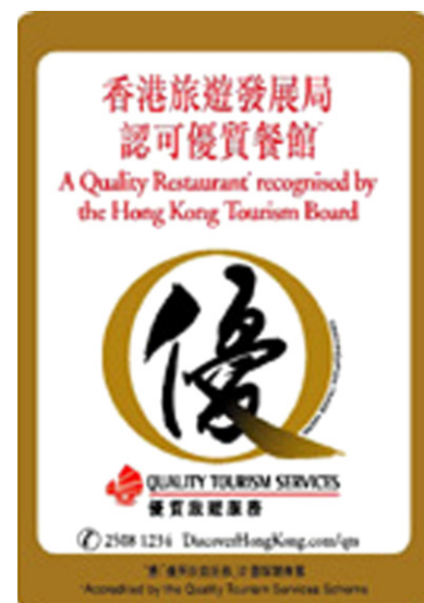
Fig. 2. QTS sign.

Restaurant certification helps to improve and guarantee culinary quality. It upgrades tourists’ travel experience by making it easier for them to enjoy quality food. As shown in Table 1, the Hong Kong Tourism Board has created a Quality Tourism Services (QTS) Scheme and issued a QTS Sign of Quality (see Fig. 2) so that tourists can easily select retailers and restaurants recognized by the Scheme. Such a scheme helps to increase a restaurant’s service quality and to reassure tourists. The Singapore Tourism Board offers