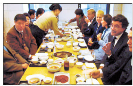
Members of Club Symposia and the diplomatic circuit enjoy a luncheon of fine Korean dining.